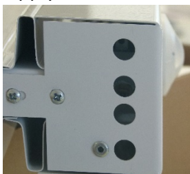
Insert a screwdriver into the middle hole